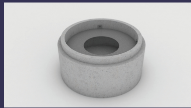
The monobase contains a scour protection ring which is bolted in place