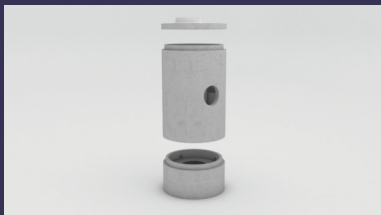
HydroStorm is composed of 3 main pieces: the monobase, riser, and flat-top

Inspection of HydroStorm units is simple with the inclusion of easy to locate frame and covers; while HydroStorm's reduced sump results in faster maintenance (a large central access opening allows cleaning of the entire separator floor), reduced cleaning and disposal costs versus the competition. Suitable as a bend, junction or inlet structure, HydroStorm can be fully customized to meet the specific needs of each site. Contact us for custom designed structures for larger drainage areas, shallow units, or other special requests.